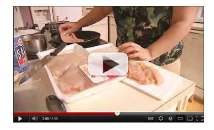
Culturally Tailored Program Helps Mexican-Americans Lose Weight