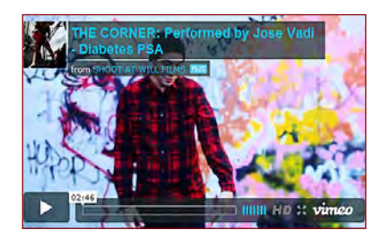
Dramatic, Poetry-Infused PSAs Target Minority Diabetes