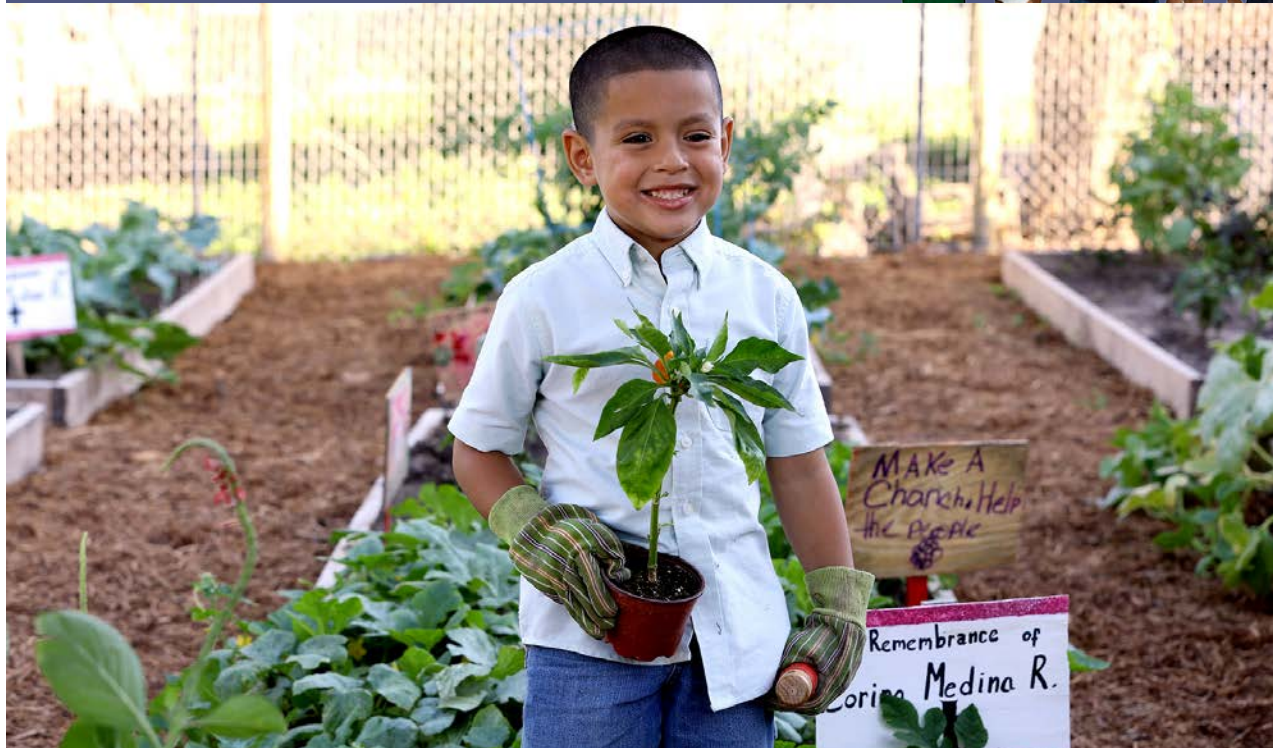
A Latino boy shows off his work at the Tres Angeles Community Garden in Brownsville, Texas