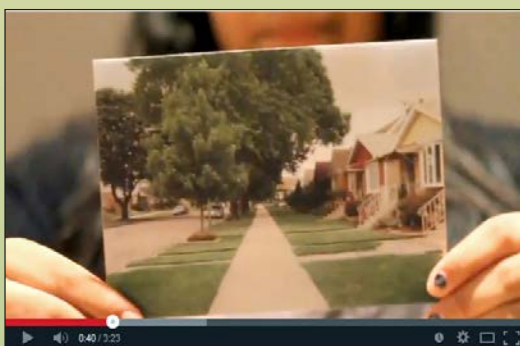
Latino Youth Struggle toward Healthier Lifestyles; Hope to Inspire Change