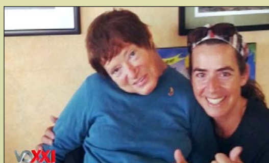
Latina Mom Helps Quadriplegic Friend Complete Triathlon