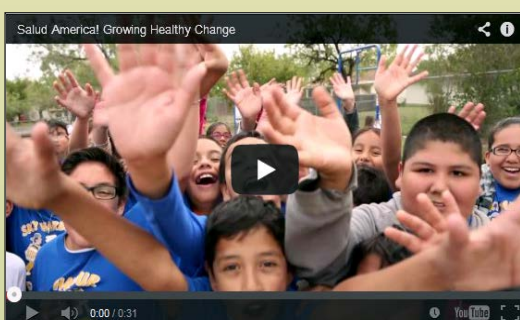
Latino Kids Need Salud Heroes. Can You Step Up?