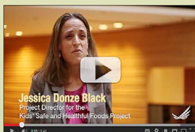
Healthier Foods in Schools