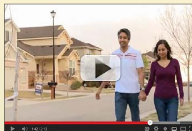
Latino Couple Support Each Other's Lifestyle Goals