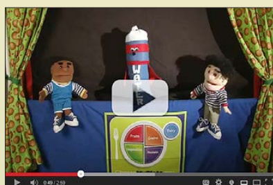
Puppets and Peers for Latino Obesity Prevention