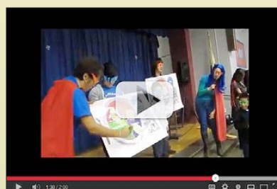
Creatively Teaching Health Education in Schools