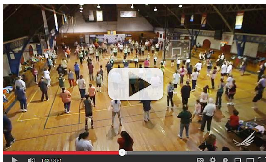
Fall River, Mass.