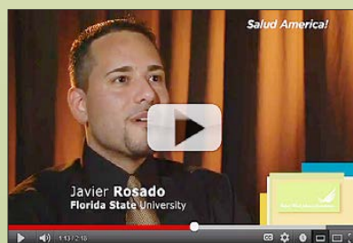
Salud America!: Creating Latino Change Agents