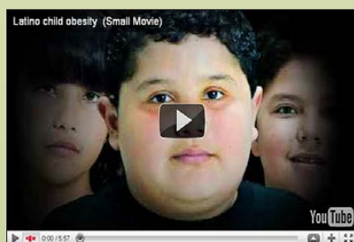
Salud America!: Introduction to Latino Child Obesity