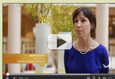
Healthier Beverage Recommendations