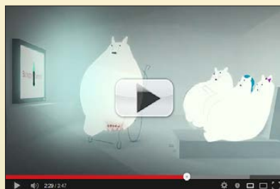
'The Real Bears' in Spanish

Click on the images to see the associated video.