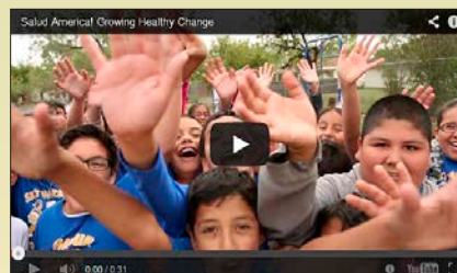
Latino Kids Need Salud Heroes. Can You Step Up?