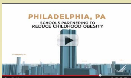
Does Where You Live Affect How Long You Live?

These communities are beacons of hope and progress for healthier people and families.