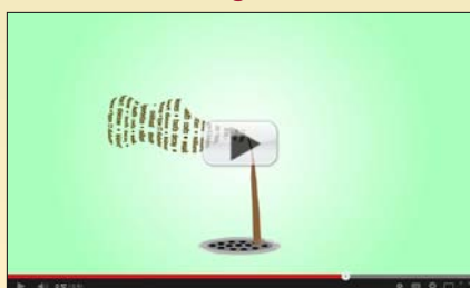
Sugary Drink Tax: It's Going To Work